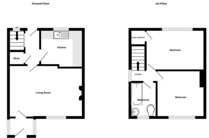
Measurements are approximate. Not to scale. Floorplan prepared only for guide purposes only. Based on drawings (2022)